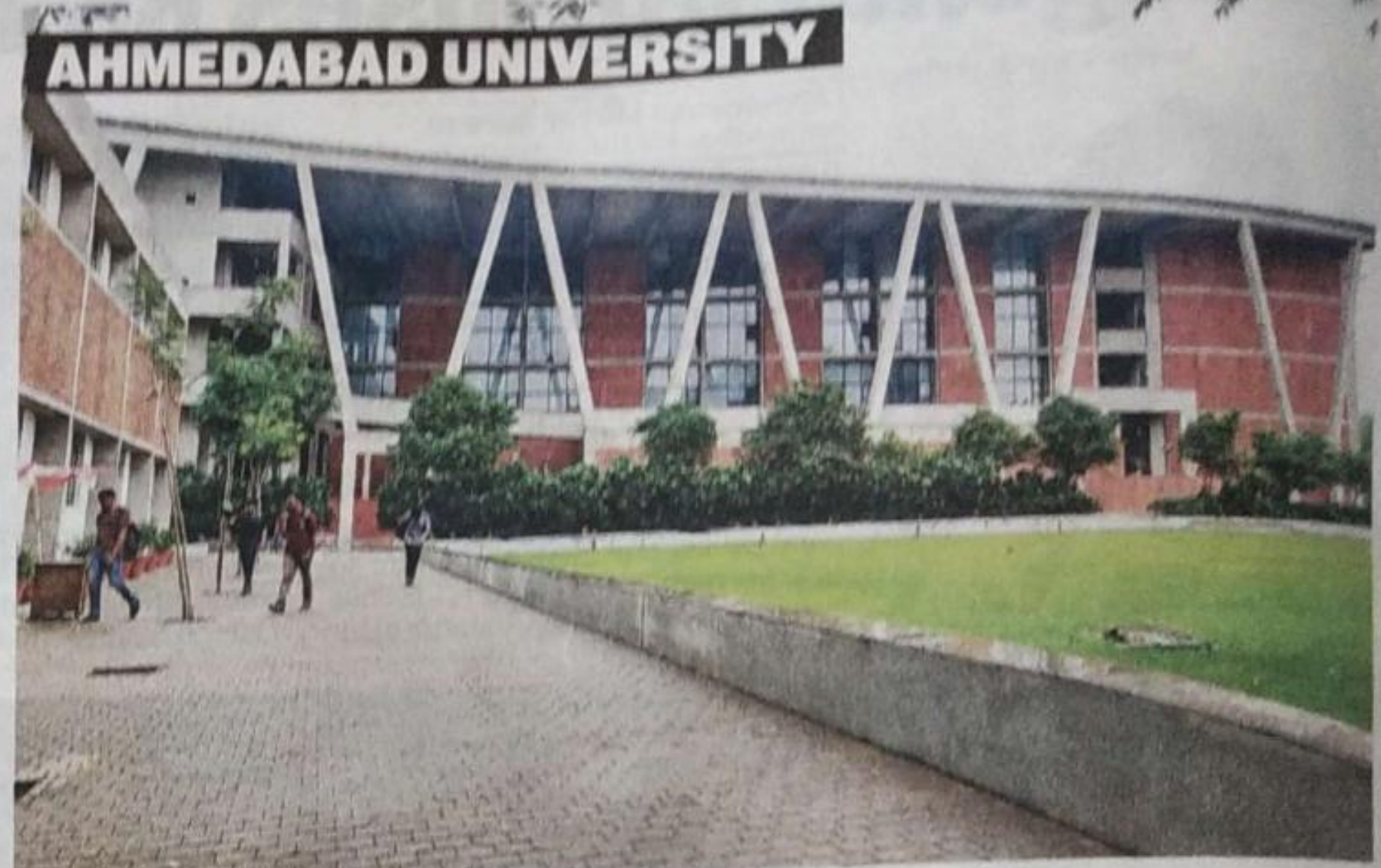
CEPT, Ahmedabad University and GNLU are among the educational institutes that have taken a lead in switching to technology to minimise loss of academic days