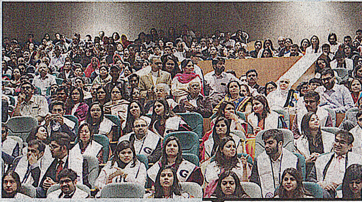
Parents were left standing in the auditorium during ceremony