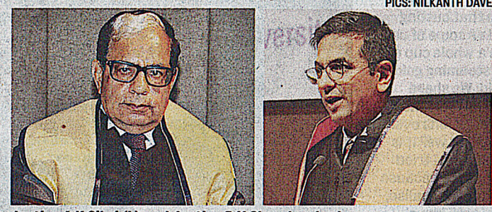
Justice A K Sikri (L) and Justice D Y Chandrachud

Ahmedabad Mirror Bureau amfeedback@timesgroup.in TWEETS @ahmedabadmrror